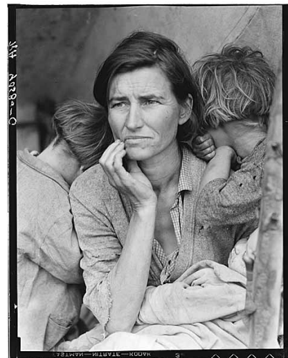
Migrant mother , Photograph by Dorothea Lange, 1936 Library of Congress, Prints & Photographs Division, FSA/OWI Collection. LC-USF34-9058-C

Among the Museum's contributions to our 2012 multidisciplinary theme will be an exhibition response to the FAC Theatre Company's production Of Mice and Men . In the exhibition, Depression-era photographs, like Dorothea Lange's classic, Migrant Mother , and current video art by the innovative artist duo Ghost of a Dream will look at aspects of cultural and personal resilience in times of economic and environmental strain. For additional classes, lectures and other programming related to Resilience please check out our website.